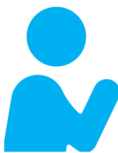
People with underlying medical conditions

Chronic liver disease Cancer Cardiovascular illness etc.