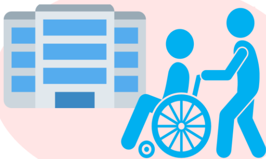
Medical institutions and nursing homes